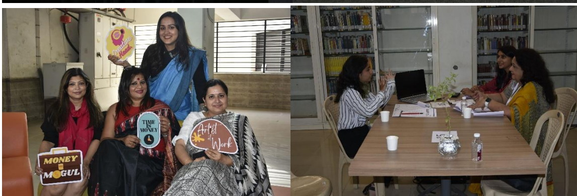
ANTRAPRENEUR THE BUSIENSS INCUBATOR